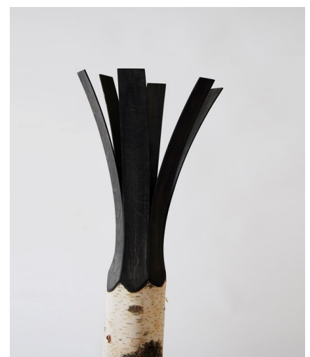
The Floor lamp & Black Floor lamp

Height : 1.9 m / 1.5m / 80cm Solid birch & plywood