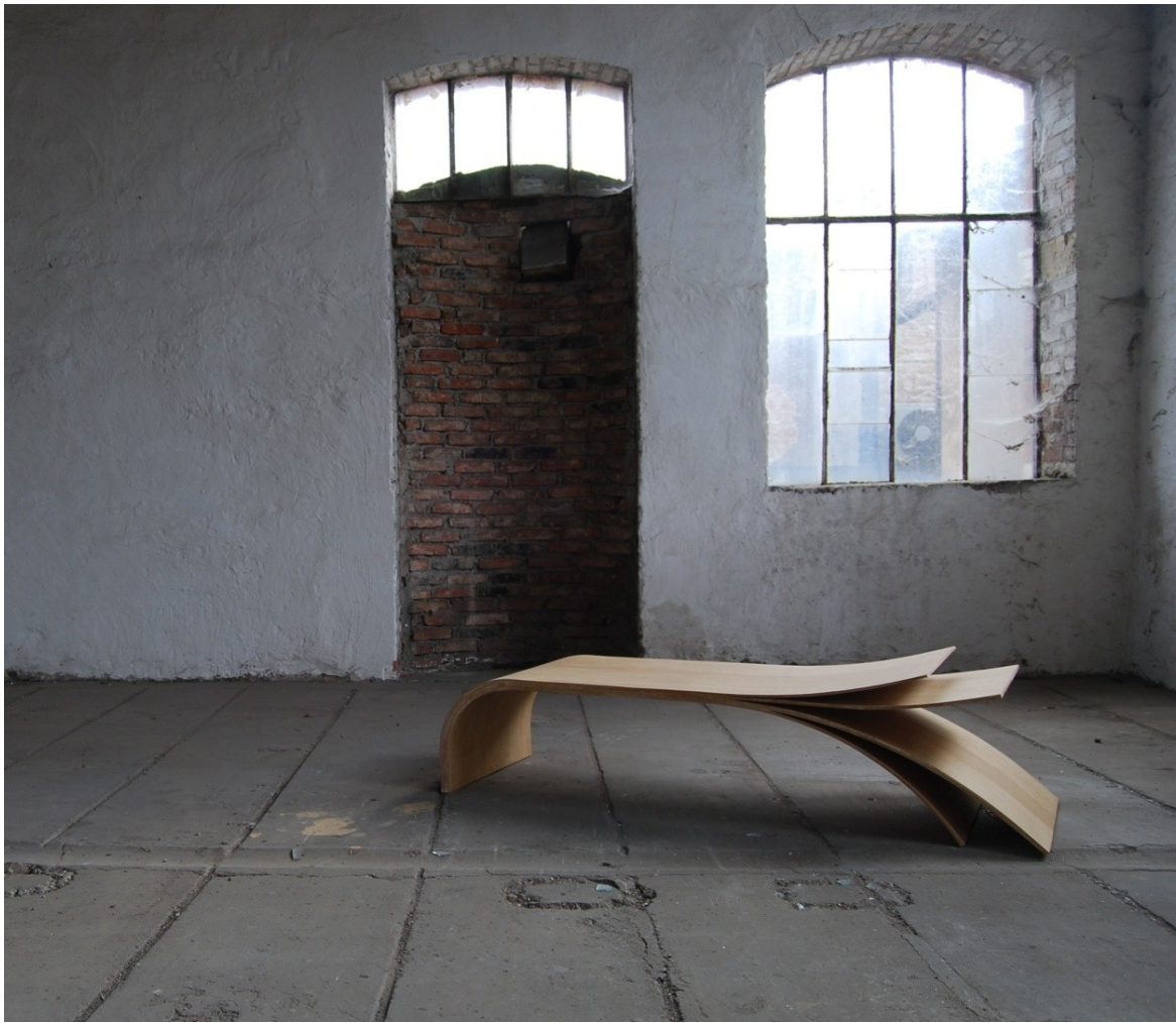
The coffee table