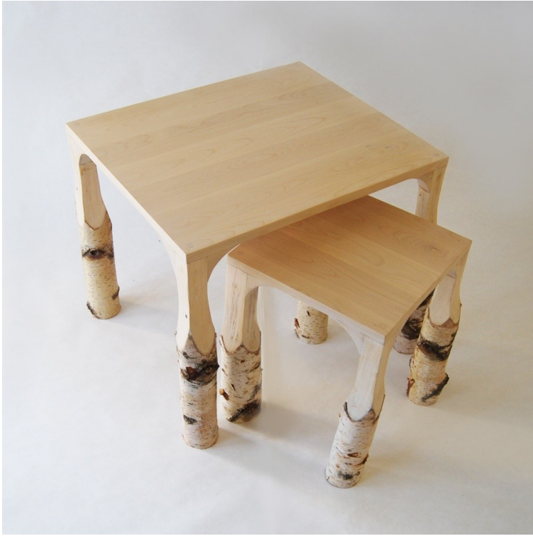
The coffee table °2

Height : 53 cm Lenght : 60 cm witdth : 50 cm solid birch