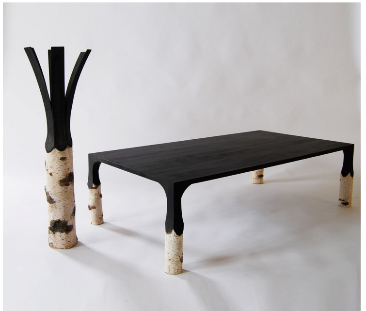
Black Coffee table

Height : 45 cm Lenght : 33 cm witdth : 33 cm solid birch