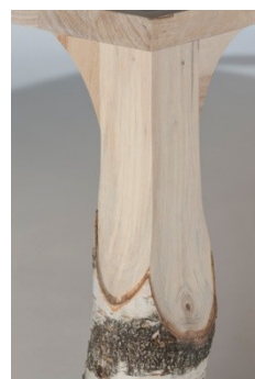
The Coffee table